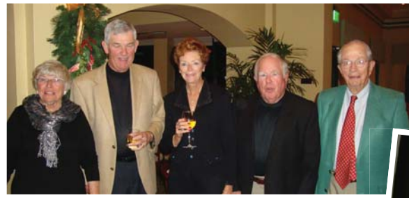
Around The Club